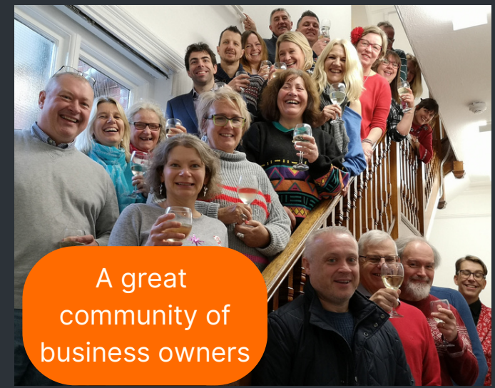
A great community of business owners