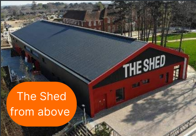
The Shed from above