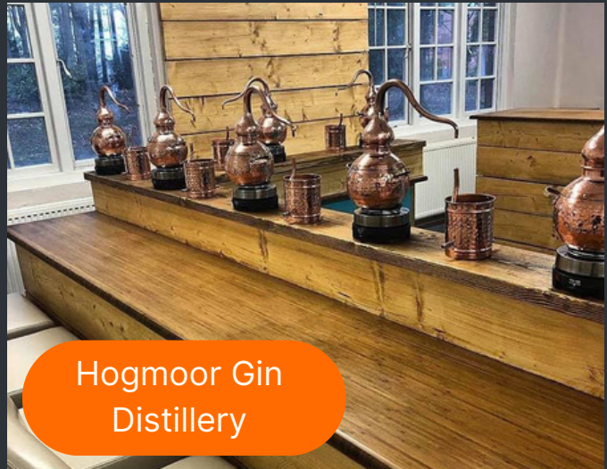
Hogmoor Gin Distillery