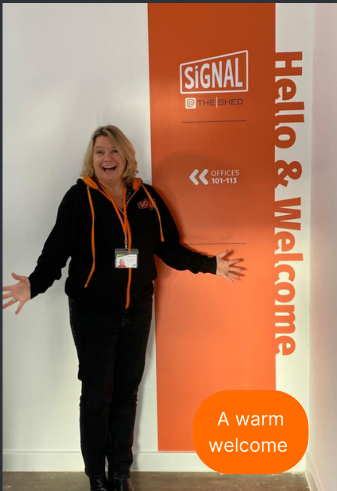
A warm welcome