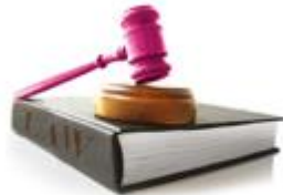
Tax planning & legal issues