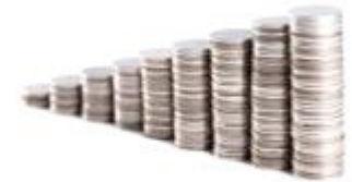
Cash flow management