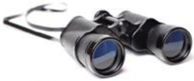
Define strategic activities and exit planning